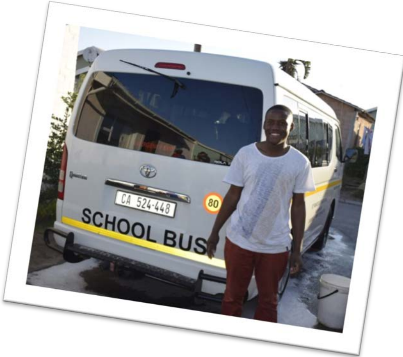
Mpho's pride and joy!

I hope you enjoyed our colourful parade.