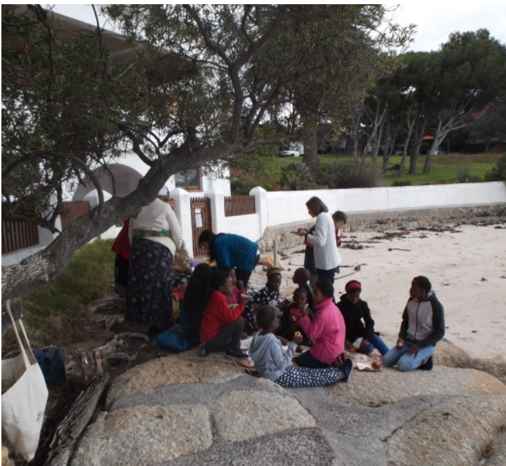
A picnic at a secluded little beach concluded our trip for