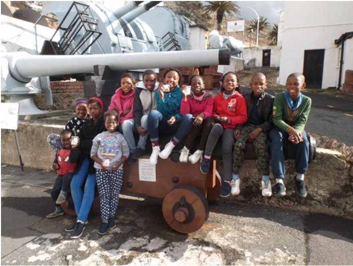
At the Naval Museum